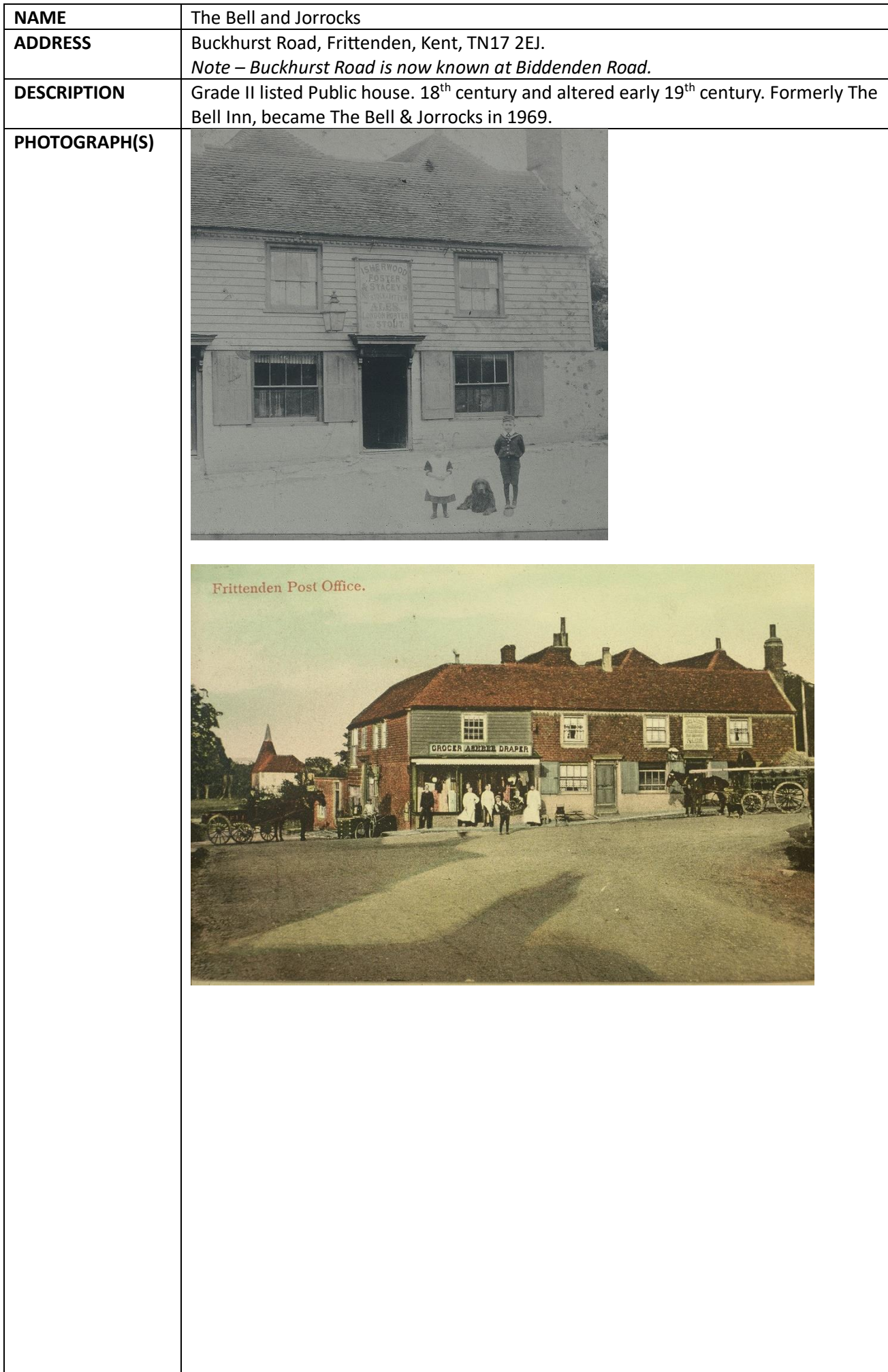
The Bell & Jorrocks (Bell Inn)